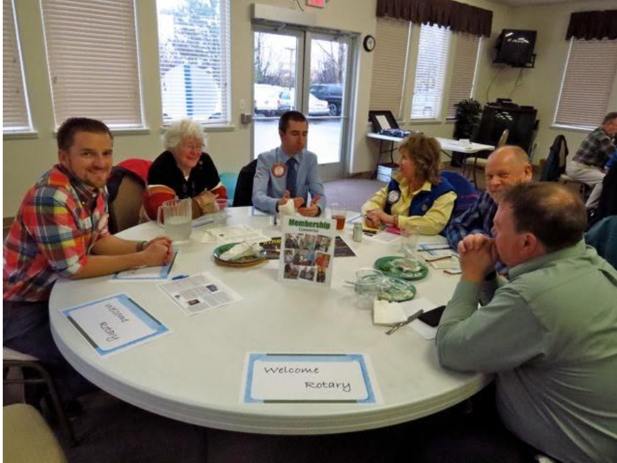
Membership Committee: Cooking up new strategies to add to the club.