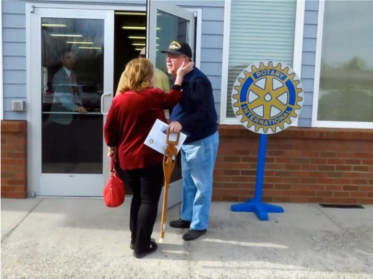
“And what’s your name little man? You have such cute cheeks!”