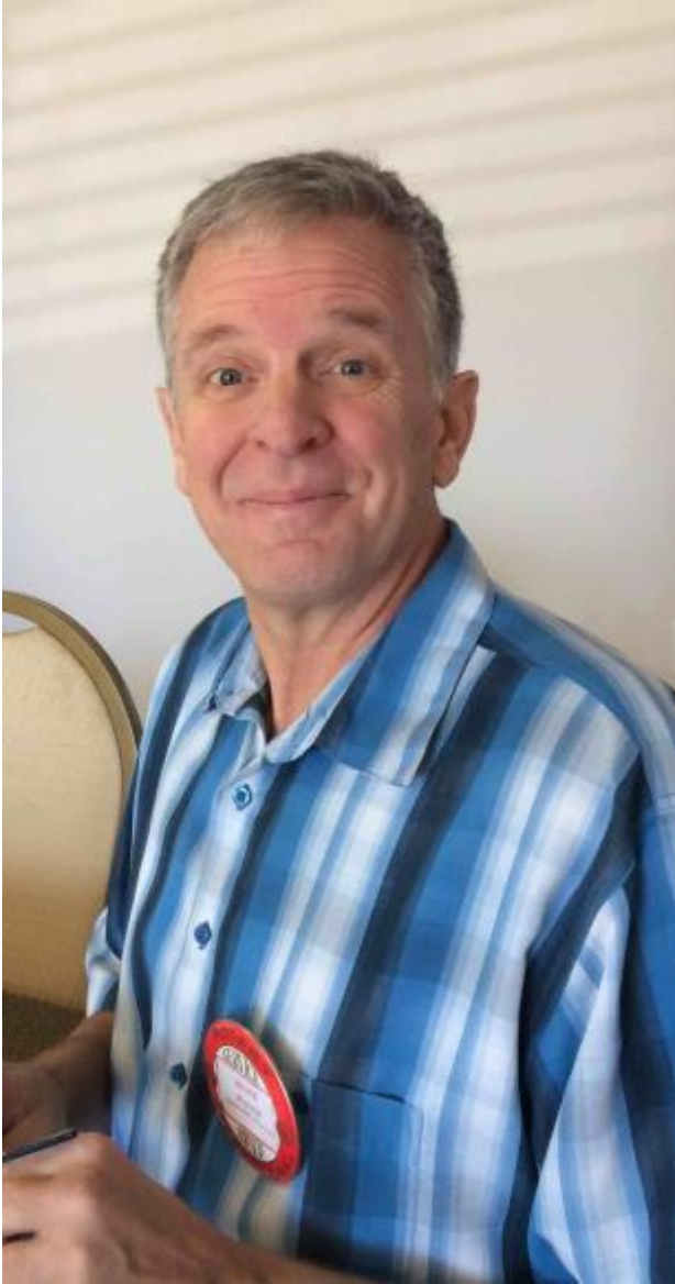
I was just walking by and somebody invited me to lunch!