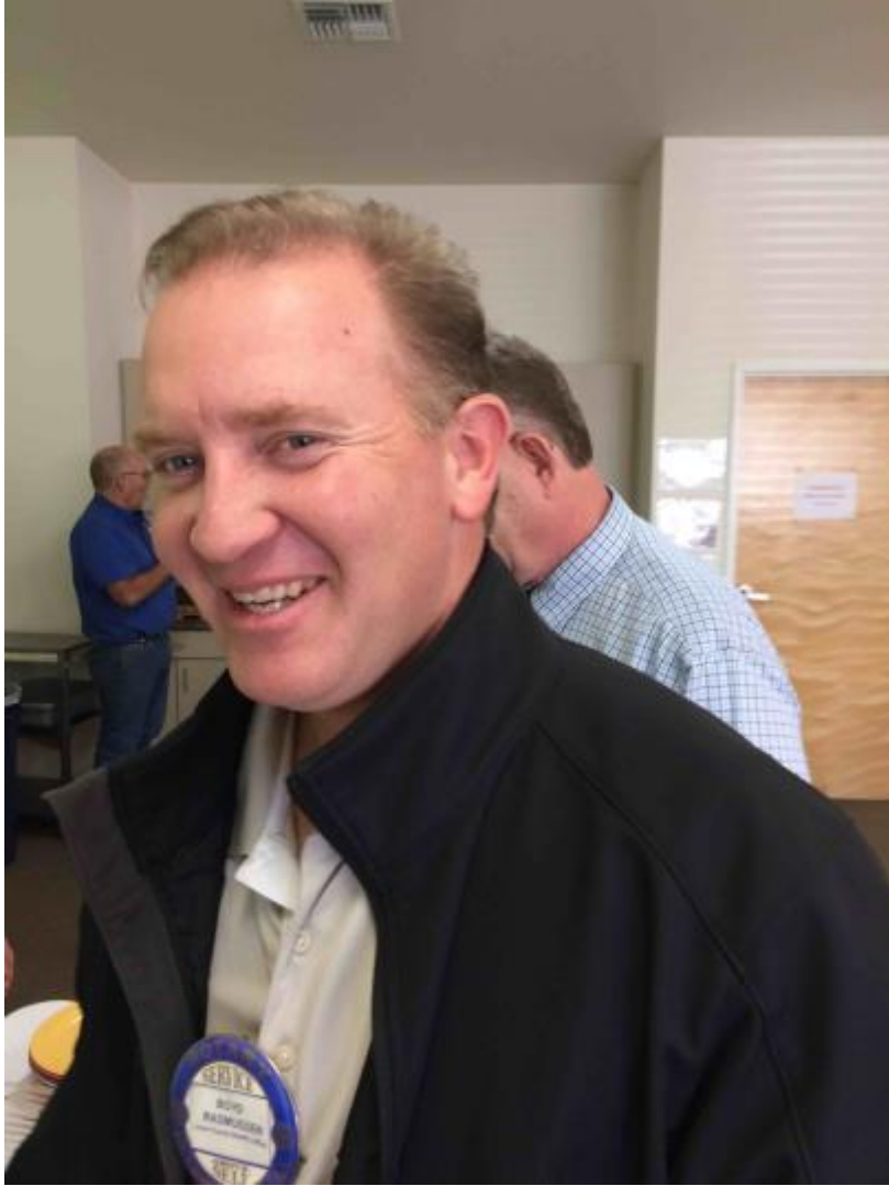
You gotta get a picture of this guy when you can...