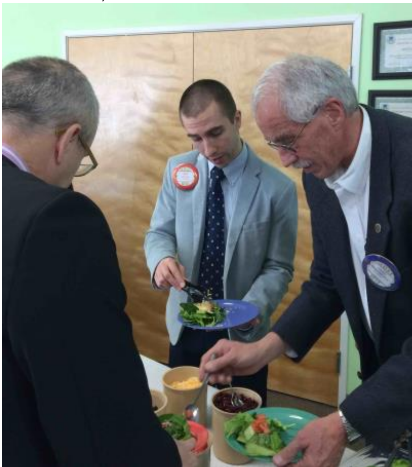
Oh, I see, the tomatoes go on the side of the salad. It is so good to learn from older Rotarians.