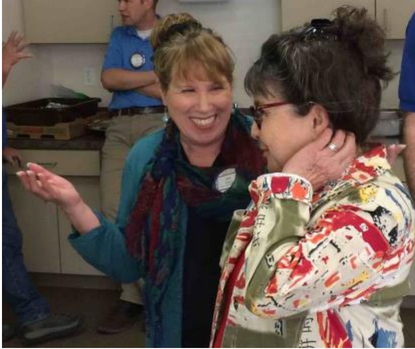
Don't be afraid, the first meal is free...